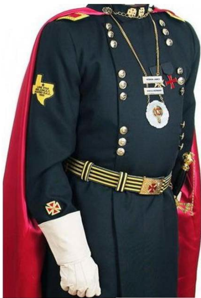
Frock coat (18 buttons)

The Dress Uniform is a black frock coat or regular black suit coat (or nehru style stand up collar) with two rows of gold Knights Templar Buttons. On the long coat they are two rows of nine, set in groups of three, on the short coat they are two rows of six, set in groups of three (see diagram) A Texas Lone Star Grand Commandery patch will be placed on both sleeves (midway between shoulder & elbow). Matching black pants to be worn as applicable. A white shirt may be worn under the coat. The shoes and socks will be black for all members.