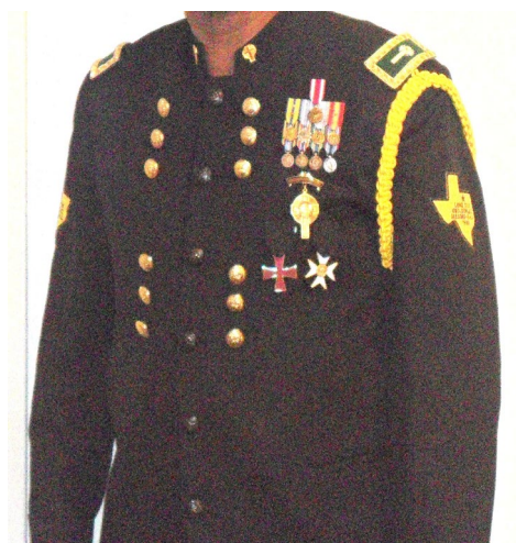
Short coat (12 buttons)